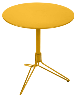
7110 - PEDESTAL TABLE Ø 26 INCH Sheet steel table top Steel tube and rod base