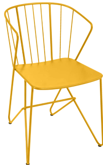
7101 - ARMCHAIR Solid steel sheet seat Steel tube and rod base and backrest