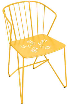
7100 - PERFORATED ARMCHAIR Laser-cut solid steel sheet seat Steel tube and rod base and backrest