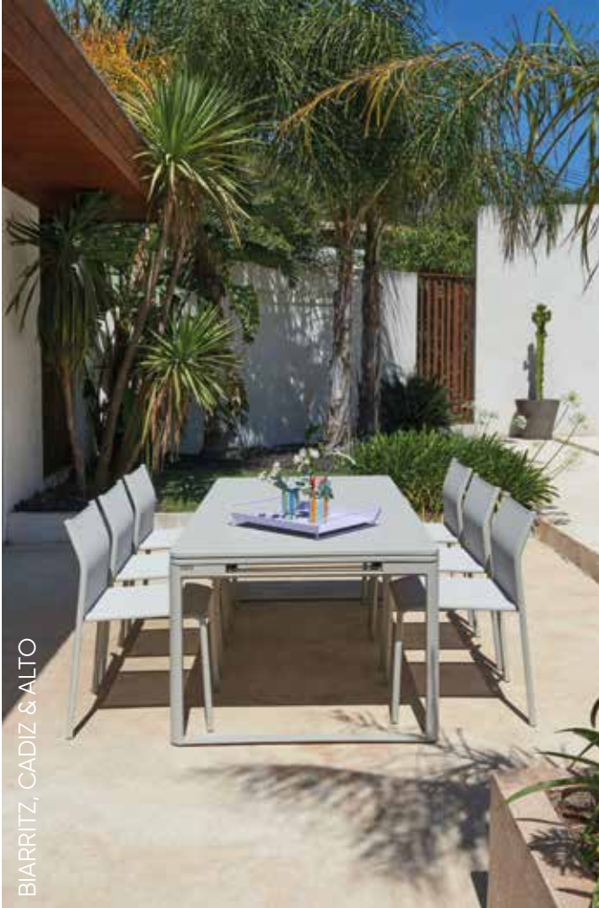
BIARRITZ, CADIZ & ALTO