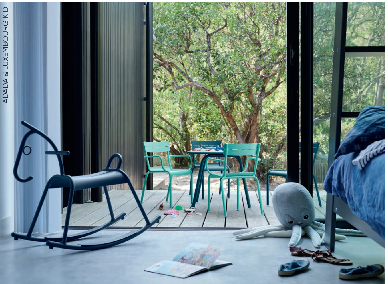
ADADA & LUXEMBOURG KID