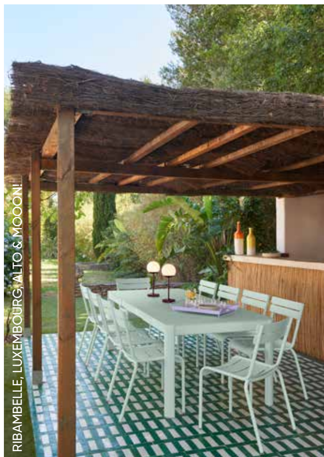
RIBAMBELLE, LUXEMBOURG, ALTO & MOOONI!