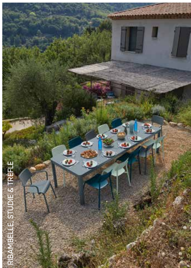
RIBAMBELLE, STUDIE & TRÉFLE