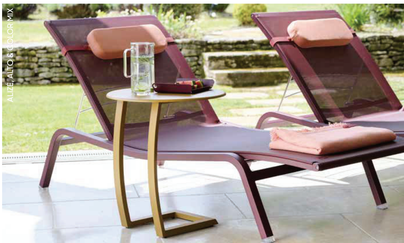
ALIZÉ, ALTO & COLOR MIX